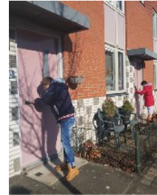
Posting invitations to the opening of "Puzzelstuk" to the neighbors

logical what we do, the creation of a good residence for our children is the most important priority in our life. In the mean time the 16 young adults became all "our children" in 32 parents. And the relationship between parents became like a family.