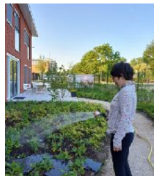
Watering the flowers which was planted by the family members

My daughter has autism and severe intellectual disabilities. She has a genetic disorder in the histon which is a new discovery and there are only 29 people with this disorder in the world. She was a sweet child and though it was an uneasy task, we have raised her with our best intention and love. The Dutch youth care system supported us all the way as she needed a lot of care. As the task often overwhelmed me, and at the same time I have two other younger children, it was often very heavy to balance my attention to other children. One day, one of