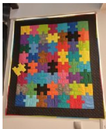
A quilt work “Puzzelstuk” decorating the entrance of the building

In the beginning of April 2023 the home for young adults with autism “Puzzelstuk” is complete. 16 of them started to live with the supports they need. It is a parents-led residential project in Leiden. Nowadays it is popular amongst parents who have children with disabilities to create an ideal home or workplace for their own children who need supports from others due to impairments. It costs the parents many years of painstaking works in order to realize such a project. It eventually took 7 years in order to build the Puzzelstuk. There are several fantastic parents-led home for young adults in the Netherlands like in Voorschoten en Leidsenburg in our area.